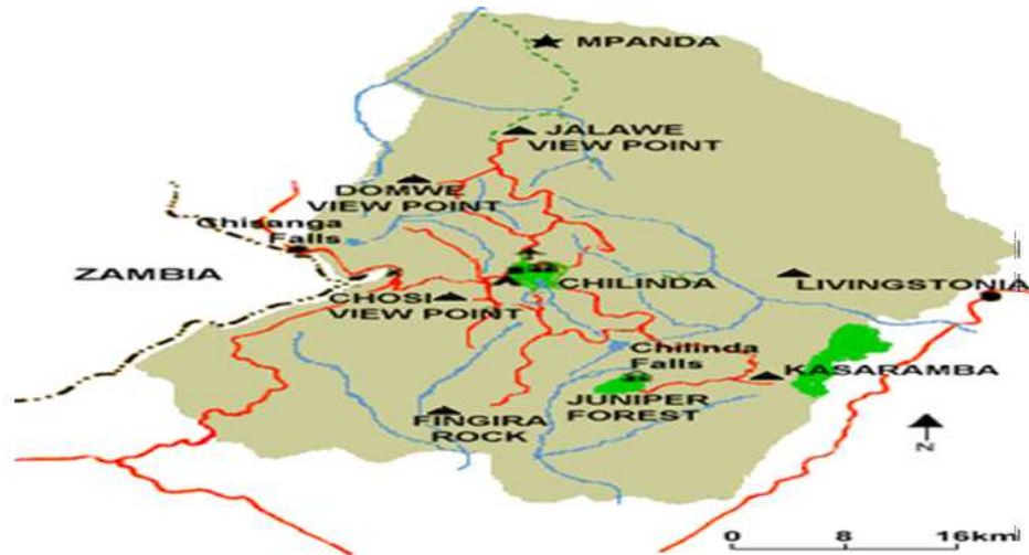
Figure 1: Map of Nyika National Park